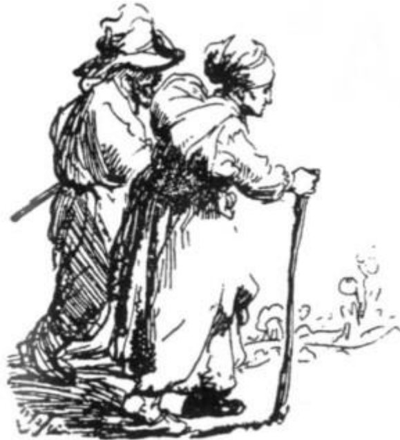
No. 116. Two Tramps.