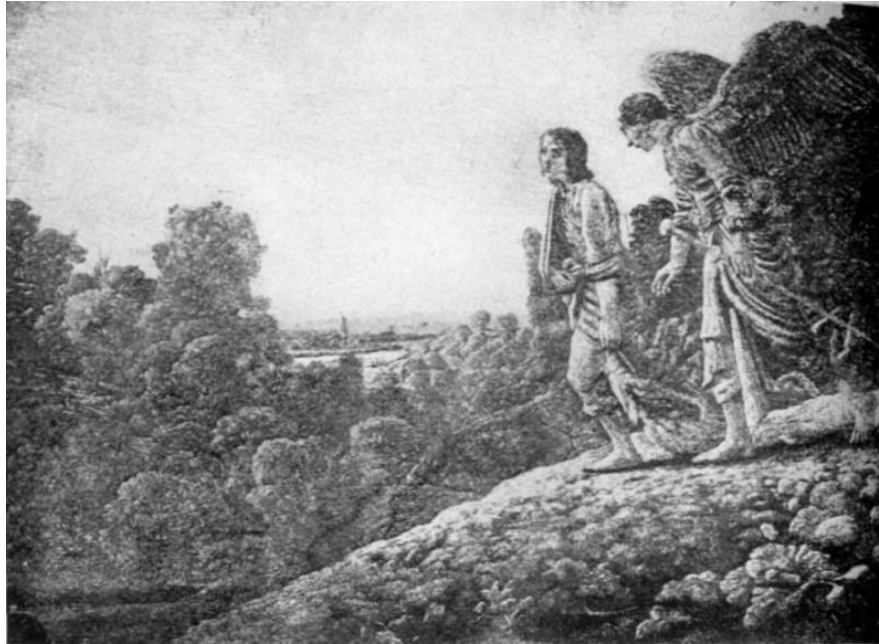
Tobias and the Angel. By Hercules Seghers