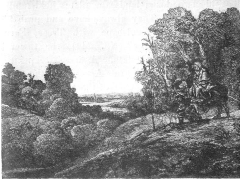
(No. 266). The Flight into Egypt.