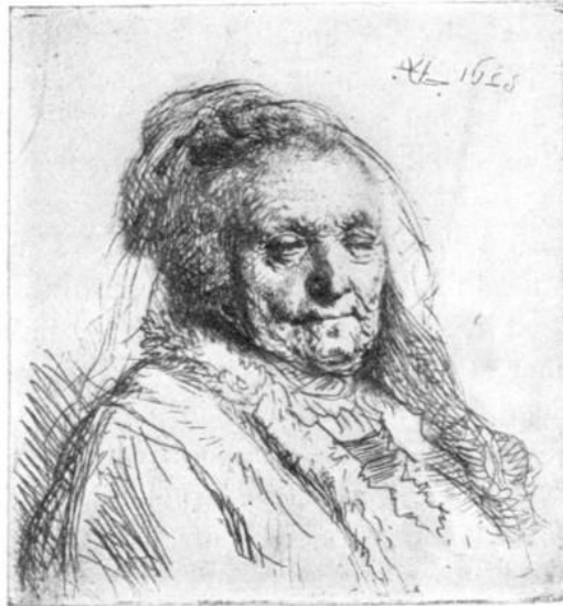
No. 1. Rembrandt's Mother.