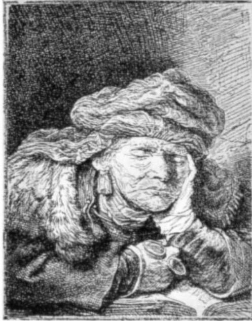
No. 129. Old Woman Sleeping.