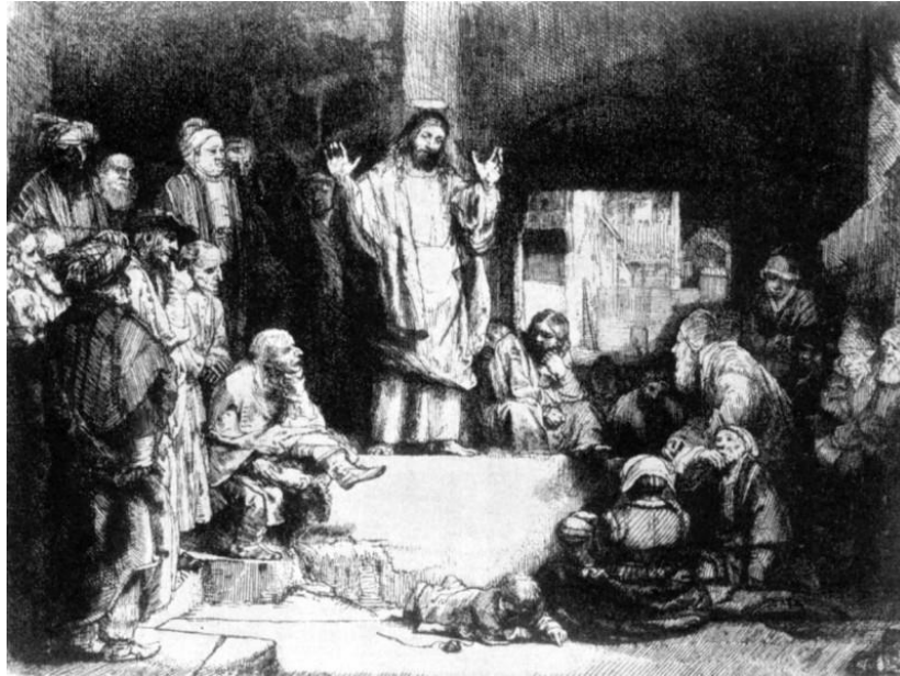
No. 256. Christ Preaching.