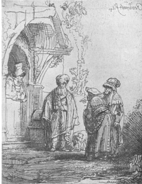
No. 183. Jacob and Laban (?).