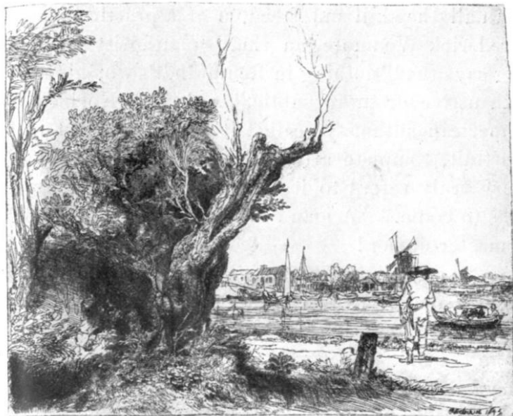
No. 210. Omval.