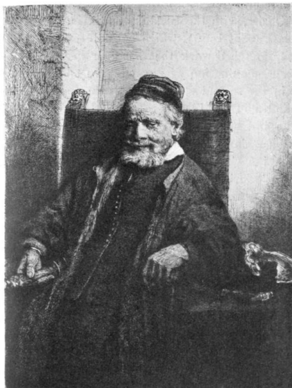
No. 290. Jan Lutma, Goldsmith and Sculptor.