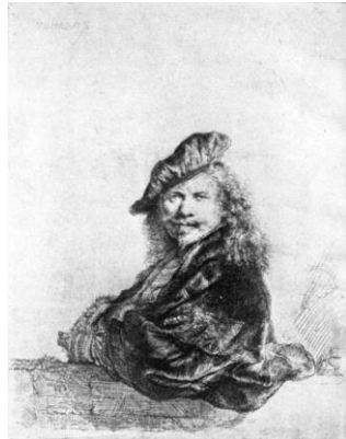
No. 168. Rembrandt Leaning on a Stone Sill