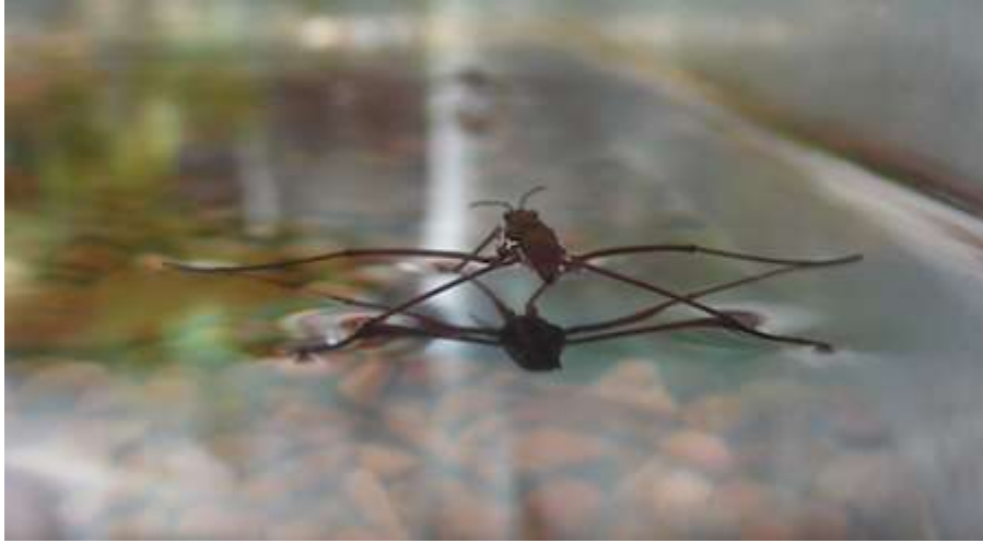
Image of a water strider bug walking on the surface of water. This is possible thanks to the surface tension of the water.

Image credit: " Water: Figure 6 , by OpenStax College, Biology ( CC BY 3.0 ). Image by Tim Vickers.