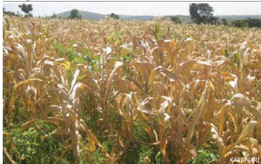
An infected maize crop: The disease can desttroy an entire maize field in a short time.

An unknown maize disease has been discovered in Bomet and could spread to the rest of the country.