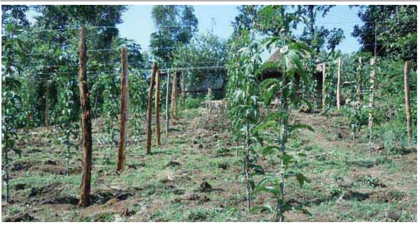
A passion fruit orchard belonging to a member of Chebugundi progressive group.