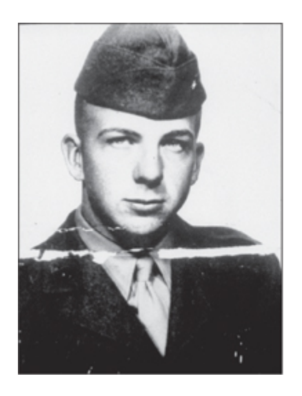
PART 4 SADIE AND THE GENERAL