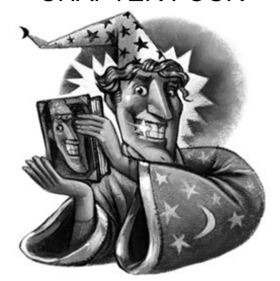
At Flourish and Blotts

Life at The Burrow was as different as possible from life in Privet Drive. The Dursleys liked everything neat and ordered; the Weasleys' house burst with the strange and unexpected. Harry got a shock the first time he looked in the mirror over the kitchen mantelpiece and it shouted, 'Tuck your shirt in, scruffy!' The ghoul in the attic howled and dropped pipes whenever he felt things were getting too quiet, and small explosions from Fred and George's bedroom were considered perfectly normal. What Harry found most unusual about life at Ron's, however, wasn't the talking mirror or the clanking ghoul: it was the fact that everybody there seemed to like him.