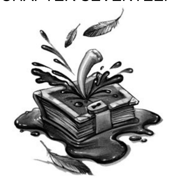
The Heir of Slytherin

He was standing at the end of a very long, dimly lit chamber. Towering stone pillars entwined with more carved serpents rose to support a ceiling lost in darkness, casting long black shadows through the odd, greenish gloom that filled the place.