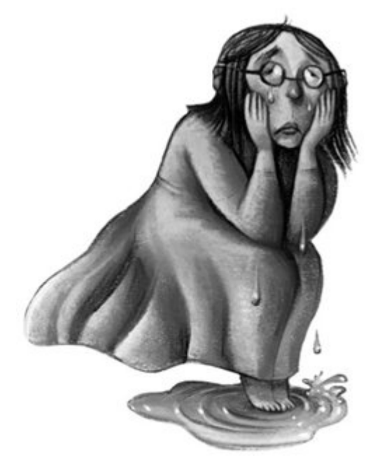
The Writing on the Wall

'What's going on here? What's going on?'