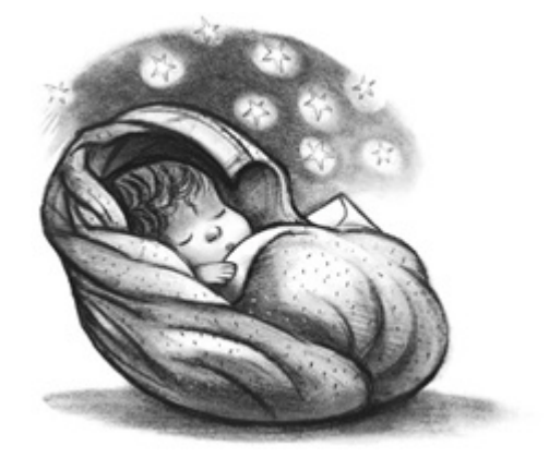
The Boy Who Lived

Mr and Mrs Dursley, of number four, Privet Drive, were proud to say that they were perfectly normal, thank you very much. They were the last people you'd expect to be involved in anything strange or mysterious, because they just didn't hold with such nonsense.