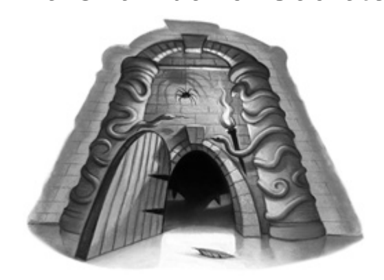
BY J.K. ROWLING