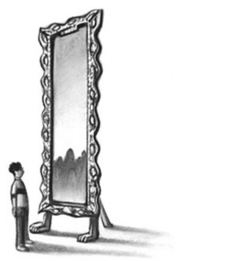
The Mirror of Erised

Christmas was coming. One morning in mid-December, Hogwarts woke to find itself covered in several feet of snow. The lake froze solid and the Weasley twins were punished for bewitching several snowballs so that they followed Quirrell around, bouncing off the back of his turban. The few owls that managed to battle their way through the stormy sky to deliver post had to be nursed back to health by Hagrid before they could fly off again.