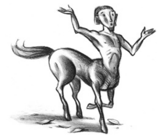
The Forbidden Forest