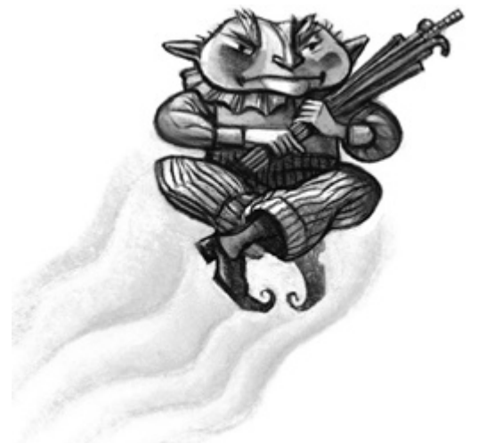
The Sorting Hat

The door swung open at once. A tall, black-haired witch in emeraldgreen robes stood there. She had a very stern face and Harry's first thought was that this was not someone to cross.