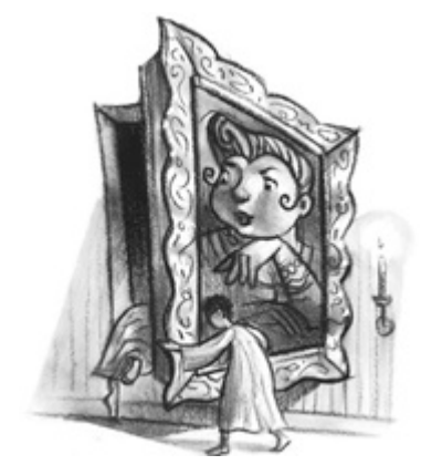
The Midnight Duel

Harry had never believed he would meet a boy he hated more than Dudley, but that was before he met Draco Malfoy. Still, first-year Gryffindors only had Potions with the Slytherins, so they didn't have to put up with Malfoy much. Or at least, they didn't until they spotted a notice pinned up in the Gryffindor common room which made them all groan. Flying lessons would be starting on Thursday - and Gryffindor and Slytherin would be learning together.