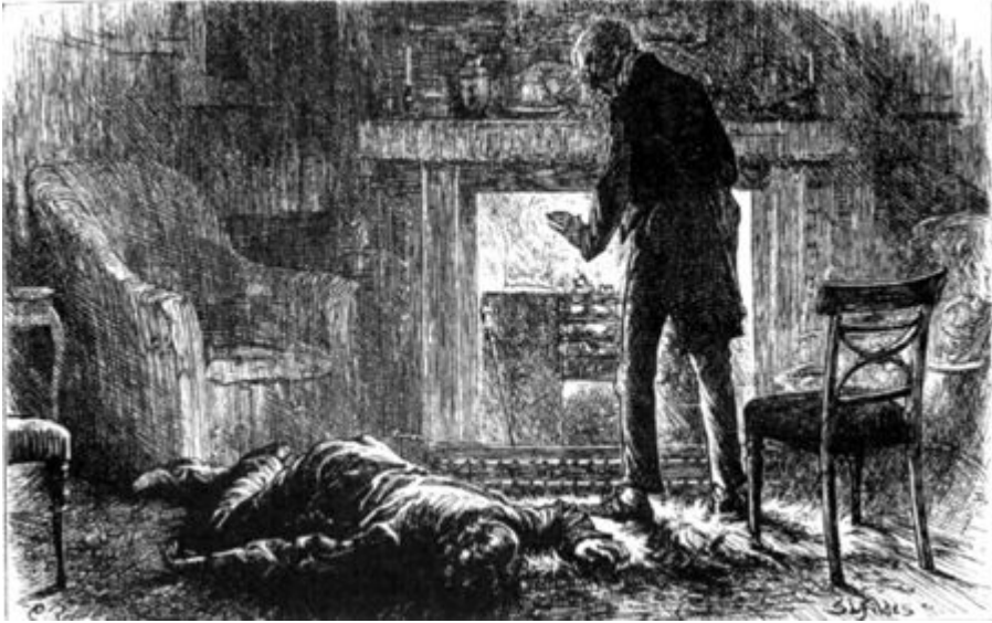
MR. GREWGIOUS HAS HIS SUSPICIONS