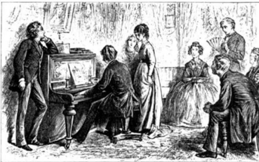
AT THE PIANO

Mr. Jasper was seated at the piano as they came into his drawing-room, and was accompanying Miss Rosebud while she sang. It was a consequence of his playing the accompaniment without notes, and of her being a heedless little creature very apt to go wrong, that he followed her lips most attentively, with his eyes as well as hands; carefully and softly hinting the key-note from time to time. Standing with an arm drawn round her, but with a face far more intent on Mr. Jasper than on her singing, stood Helena, between whom and her brother an instantaneous recognition passed, in which Mr. Crisparkle saw, or thought he saw, the understanding that had been spoken of, flash out. Mr. Neville then took his admiring station, leaning against the piano, opposite the singer; Mr. Crisparkle sat down by the china shepherdess; Edwin Drood gallantly furred and unfurled Miss Twinkleton's fan; and that lady passively claimed that sort of exhibitor's proprietorship in the accomplishment on view, which Mr. Tope, the Verger, daily claimed in the Cathedral service.