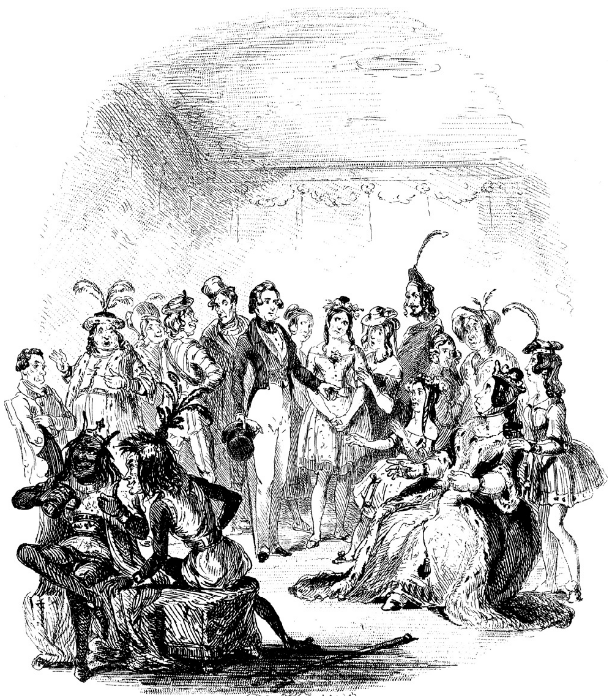
Chail Millegen with