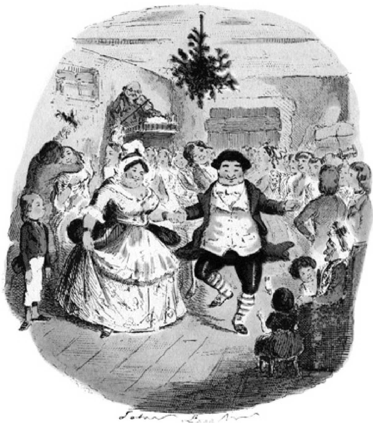
Mr. Fezziwig's Ball