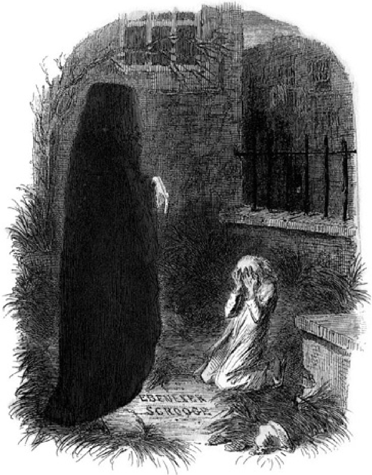
The Last of the Spirits For the first time the hand appeared to shake.