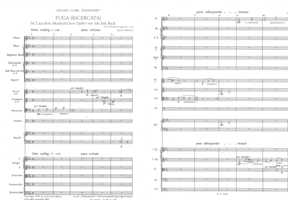
Figure 2: The first page of the Fuga Ricercata transcription by Anton Webern (1935)