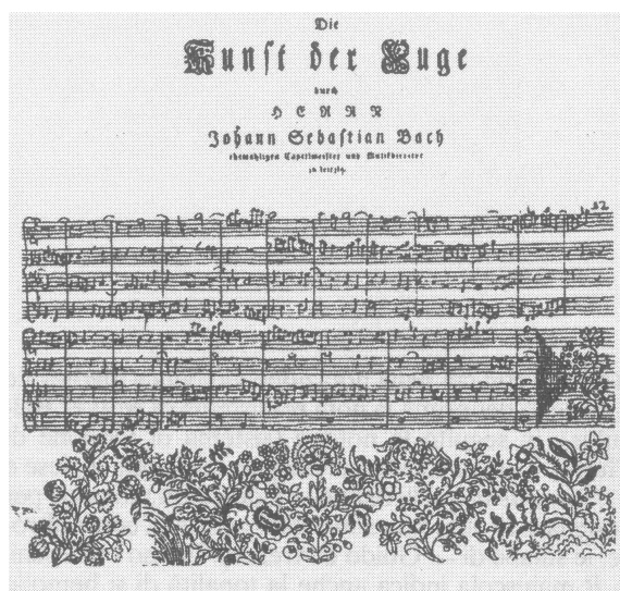
Figure 1: The first page of the first edition of the Kunst der Fuge by Johann Sebastian Bach (1750)

Since vocal polyphonic music was at the root and beginning of occidental music, it is easy to understand that early techniques were devoted to developing polyphonic music so that voices could