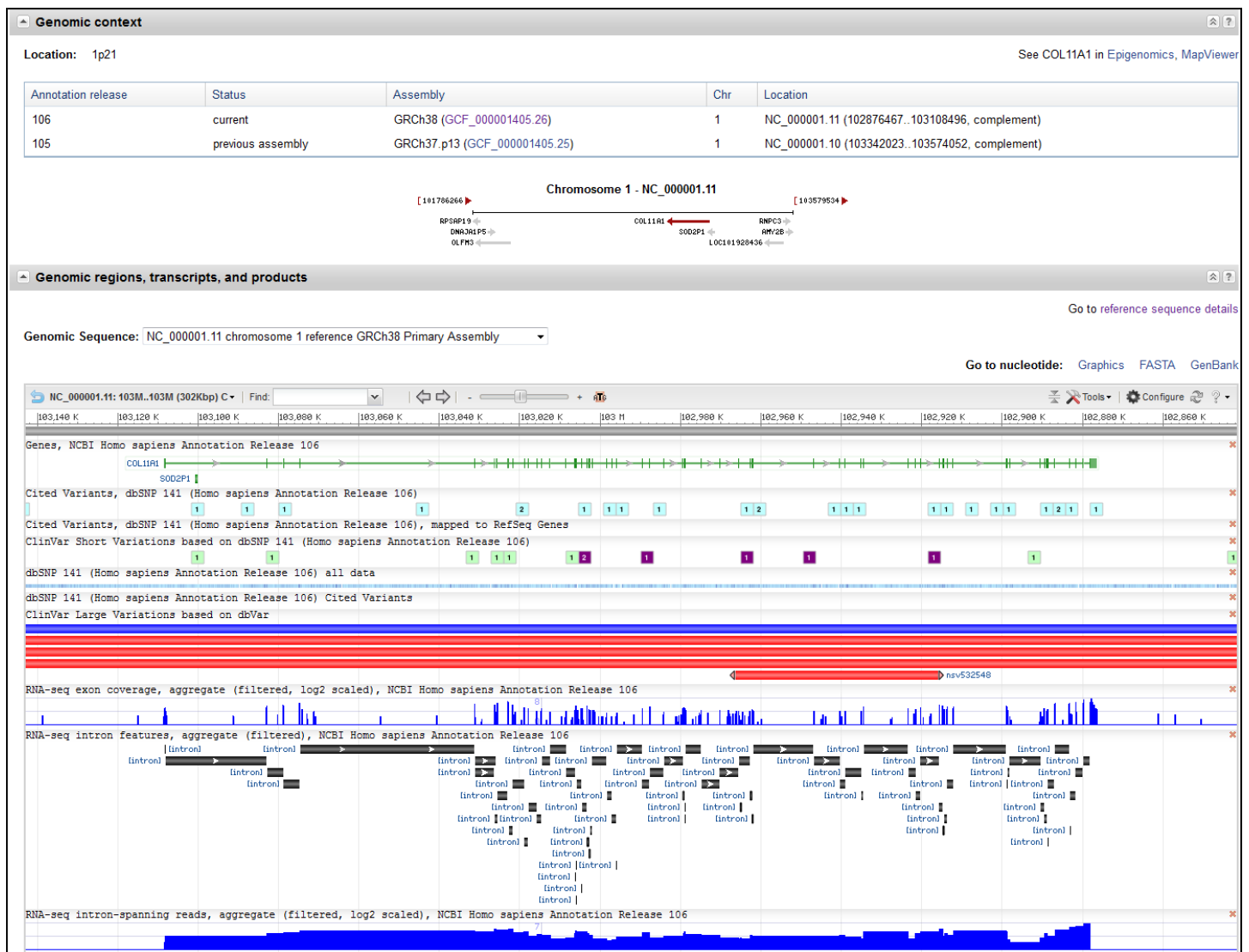
Figure 6. Genomic context and Genomic regions, transcripts, and products sections of the Full Report display. These sections provide diagrams of the gene and its neighbors, the gene's intron/exon organization, and the RefSeqs that are used to represent RNA products and their coding regions. These sections also anchor links to the sequence in FASTA and GenBank format, the full nucleotide Graphics viewer, and the NCBI Genome Data Viewer. Additional tracks may be displayed based on available data. For example, variant tracks, Ensembl annotation, and RNA-Seq coverage tracks may be displayed for human genes.