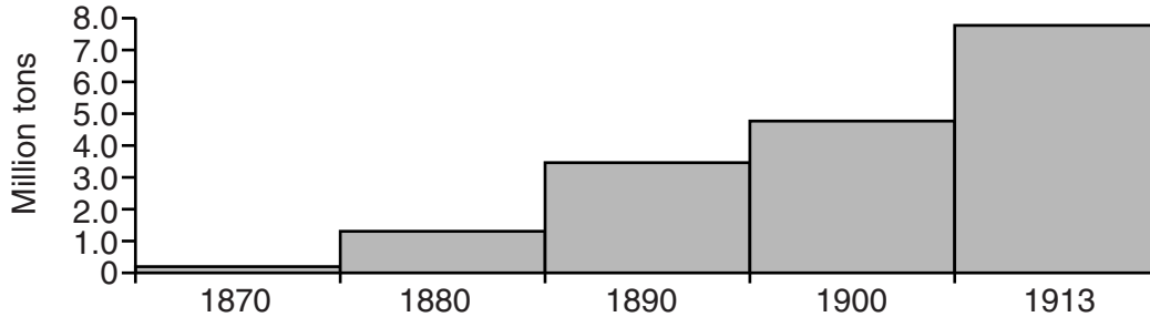
Diagram showing the growth in British steel production, 1870–1913.