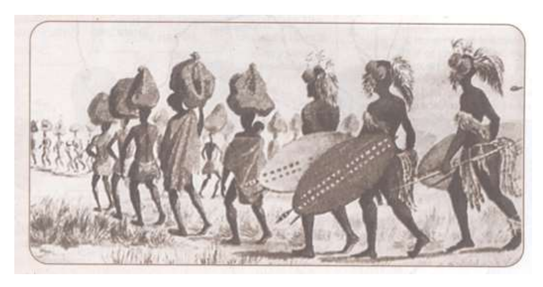
Nguni warriors during the Mfecane

Study the source below and answer the questions that follow.