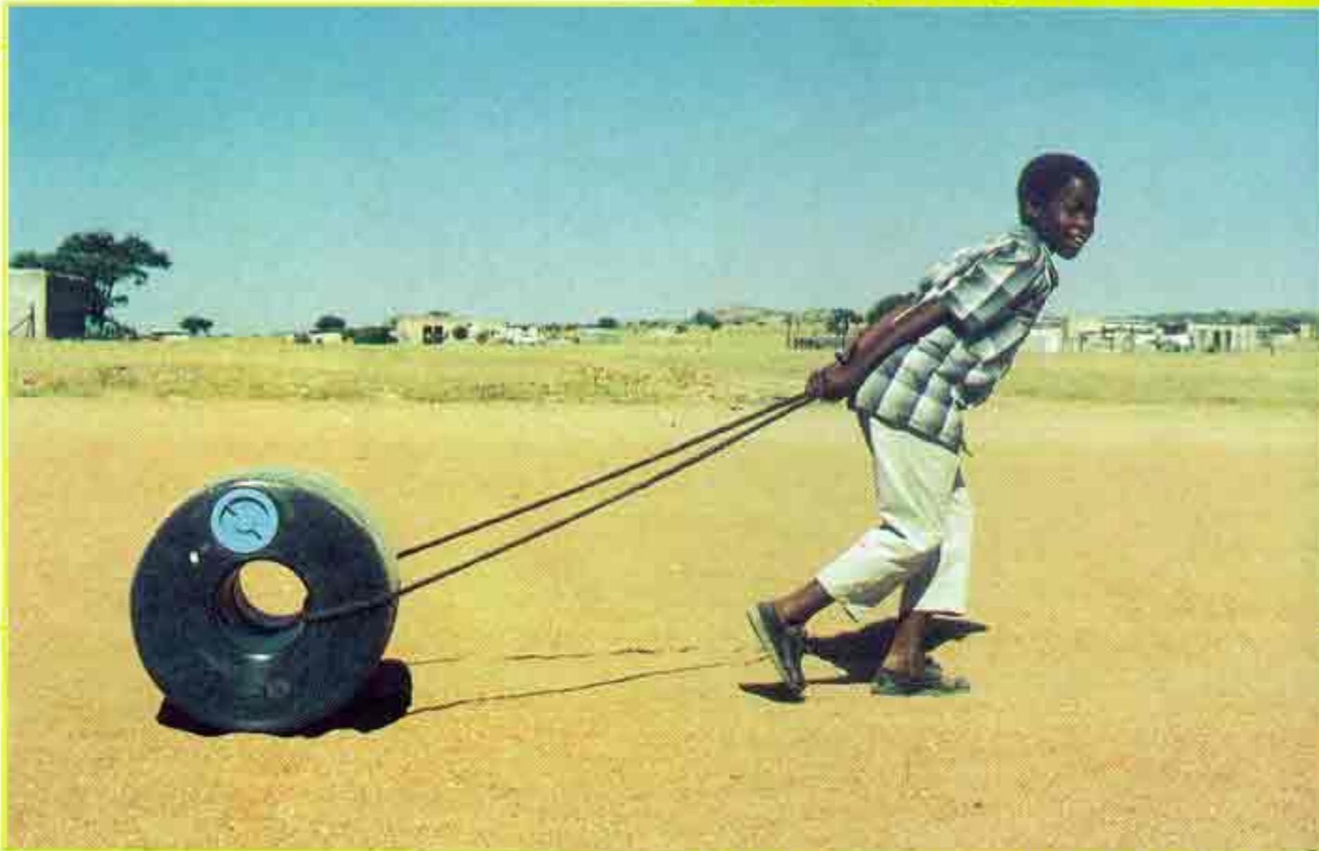
A child can easily pull a 50-liter Q-Drum over flat terrain for several kilometers

According to its inventors, the Q-Drum has transformed the centuries-old drudgery of fetching water into something akin to fun. They say a child can pull a 50-liter drum over flat terrain for several kilometers without undue strain. During field tests by the Hendrikse brothers, a drum that was used daily for more than 20 months traveled 12,000 kilometers, made 7 million revolutions and provided a family of 13 people with 120,000 liters of potable water. During that time, the Q-Drum had worn less than half a millimeter—giving the container a life-span of more than 10 years. "Water is our life," says Grace Tombane,