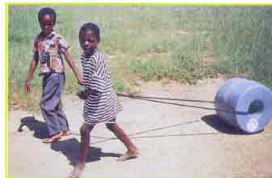
Children transform the Q-Drum into a useful toy, making fetching water a lot more fun