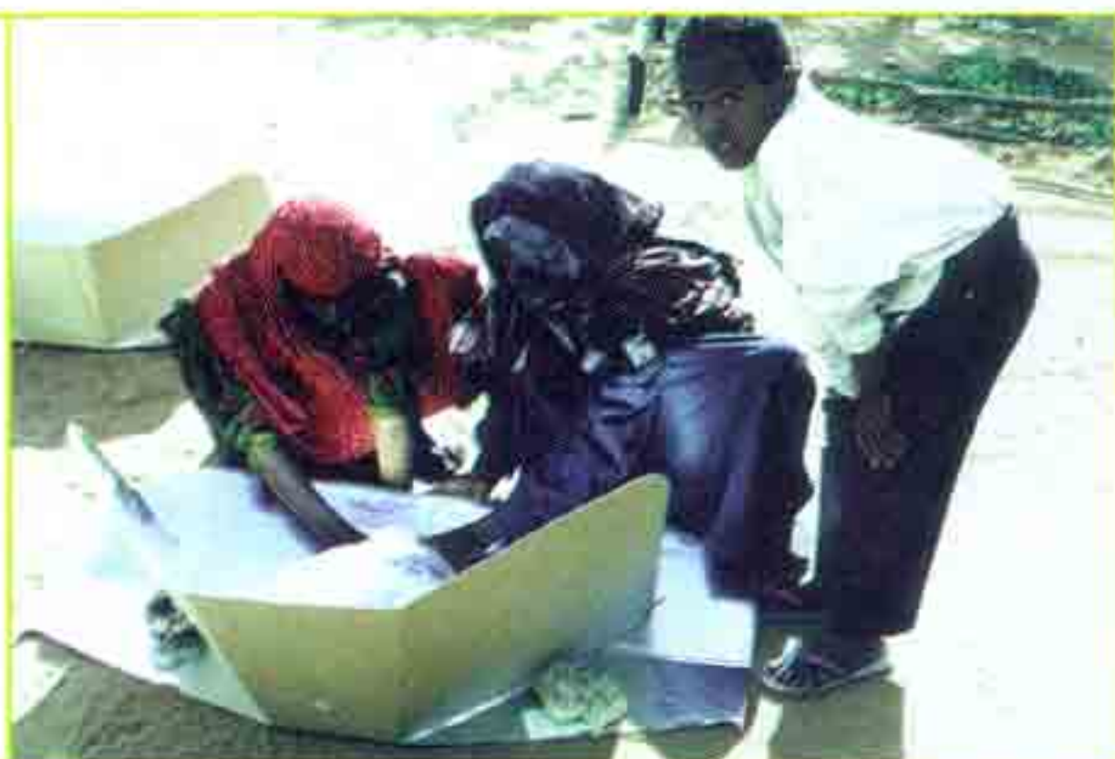
The solar cooker, a simple combination of folded cardboard and aluminum foil, harnesses the sun's power to cook meals and boil water