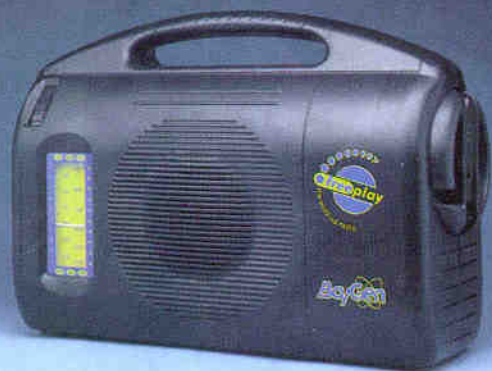
The BayGen wind-up radio uses clockwork power to broadcast news and information