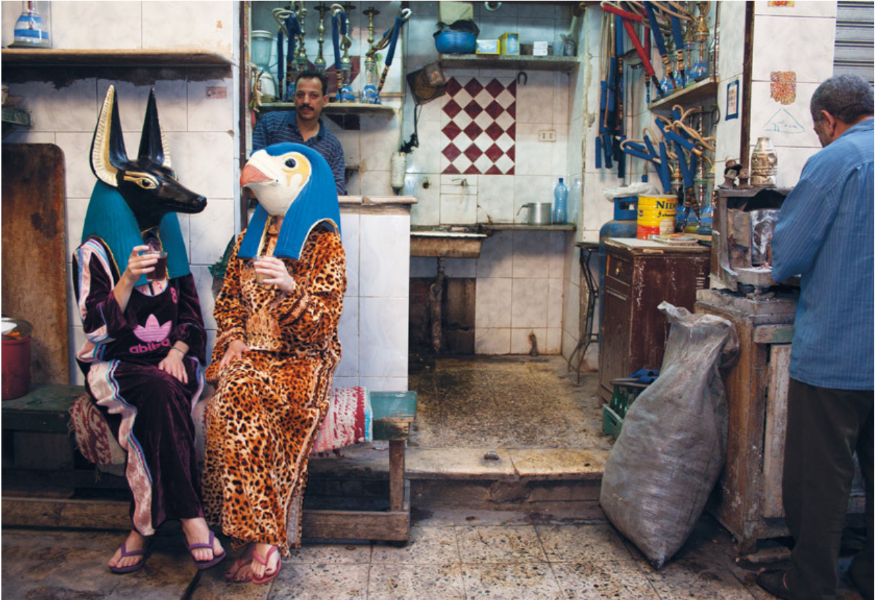
J&K, Horus and Anubis in Islamic Cairo, 2006, photo, 75 × 112 cm.