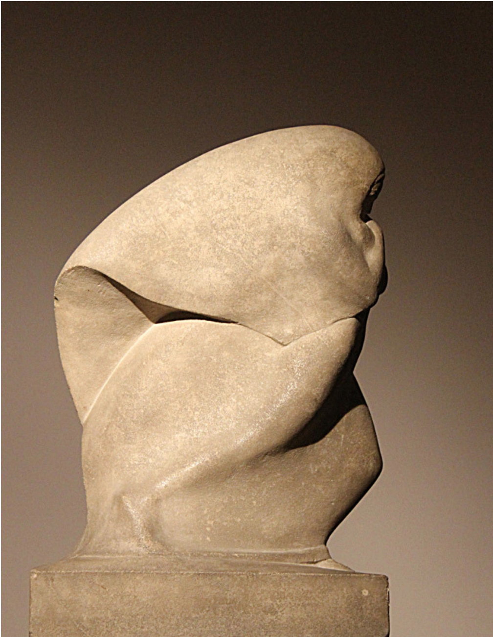
MAHMOUD MOUKHTAR , Khamasin Wind , 2012 replica of 1929 original, white stone, 57 × 41 × 21 cm.