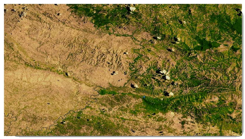
Public domain photo (NASA).

We are looking to both minimize the resources we use as well as use better resources such as renewable energy. Some resources, like sand and salt water, may be abundant, however, we want to use resources that are not only abundant and renewable, but high quality. It is not enough to just have a more efficient stove to reduce fuel consumption; you also need to have a management program for the fuel that feeds the stove. We might expect that in general, fuel consumption would decrease as income increases, since people tend to shift toward using resources that are more efficient and of higher quality. This is not always the case, however, because it depends on what is available in the region we are talking about.