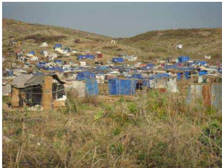
Many new camps were established in the environs of Port-au-Prince in the aftermath of the earthquake.

According to Government estimates, over half a million people left Port-au-Prince in the days following the earthquake. In order to maintain the attractiveness of the regions, the UN team decided to make shelters available on a preferential basis to those who moved to the interior. It was also decided that all relief agencies and NGOs would provide essential support services – food, health, education, employment and counseling – in the regions. In addition, a system for host family support was initiated, whereby any family in the interior that was housing a displaced family member from Port-au-Prince would be given a lump sum, plus a monthly allowance to support them.