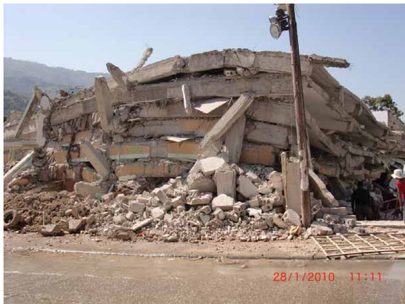
The earthquake caused multiple building storeys to crumble onto each other, compacting everything within.

The situation in Port-au-Prince presents a similar scenario to other earthquake-related disasters, with a large-scale destruction of buildings burying everything below. In addition, a number of buildings that are currently standing are unsafe for use and will need to be demolished, thereby producing even more debris.