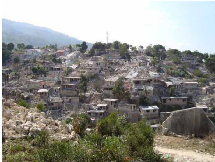
The presence of a fault line beneath the hills of Pétionville makes the area unsuitable for resettling impacted populations.

In addition, there was consensus between communities, the Government and NGOs that settling displaced people in low-lying areas around the city was not practical, given the real risk of flooding from heavy rains or cyclones.