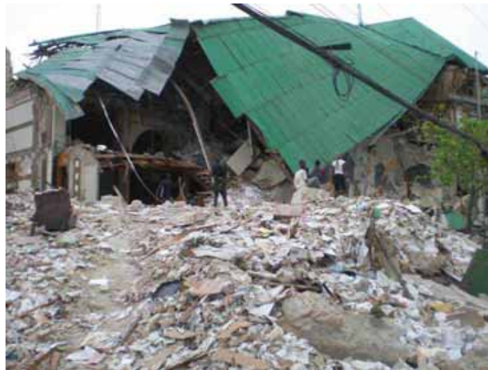
The Haitian Government infrastructure was seriously impacted by the earthquake; above, the remains of the Ministry of Environment.

In addition to the severe damage in Port-au-Prince, several cities and villages in the south of the island were impacted, resulting in extensive death and destruction. The Government has estimated that some 250,000 residences and 30,000 commercial buildings collapsed or were badly damaged. The earthquake has thus led to significant population displacement, with many people, including some whose homes were not damaged, vacating the city and moving out into the open. The United Nations estimates that up to 1.9 million people are in need of food aid for the foreseeable future.