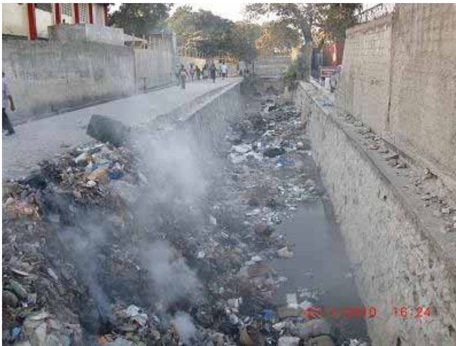
In many parts of Port-au-Prince, drainage channels are filled with solid waste. This causes localized flooding every time there is heavy rainfall.

In many parts of Port-au-Prince, the lack of municipal services for solid waste management has led to environmentally unacceptable situations. The worst example of these is the concrete drainage channel close to the main bus station in Carrefour, which is in many ways the most active part of the city, and one of the most economically important. The channel, which leads into the sea, is filled with garbage that has completely blocked the drain. In the event of heavy rains, the blockage causes the drain to flood, spreading the accumulated waste material throughout the crowded surrounding neighbourhood. Indicative of current relief efforts, the drain which was originally littered with remnants of urban life (plastic bags, tin cans, soft drink bottles, etc.) is now also full of the styrofoam packaging that is used to provide food supply to displaced communities.