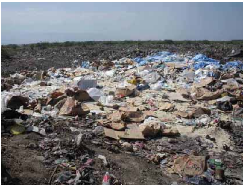
Post-disaster environmental damage is often exacerbated by the absence of effective mechanisms to dispose of the medical waste generated by emergency response operations.

Given the scale of the human tragedy caused by the earthquake, an unprecedented number of patients with varying traumas were taken to medical facilities and to temporary hospitals. Among the concerns for environmental experts was the lack of adequate facilities for the management of healthcare waste in Haiti.