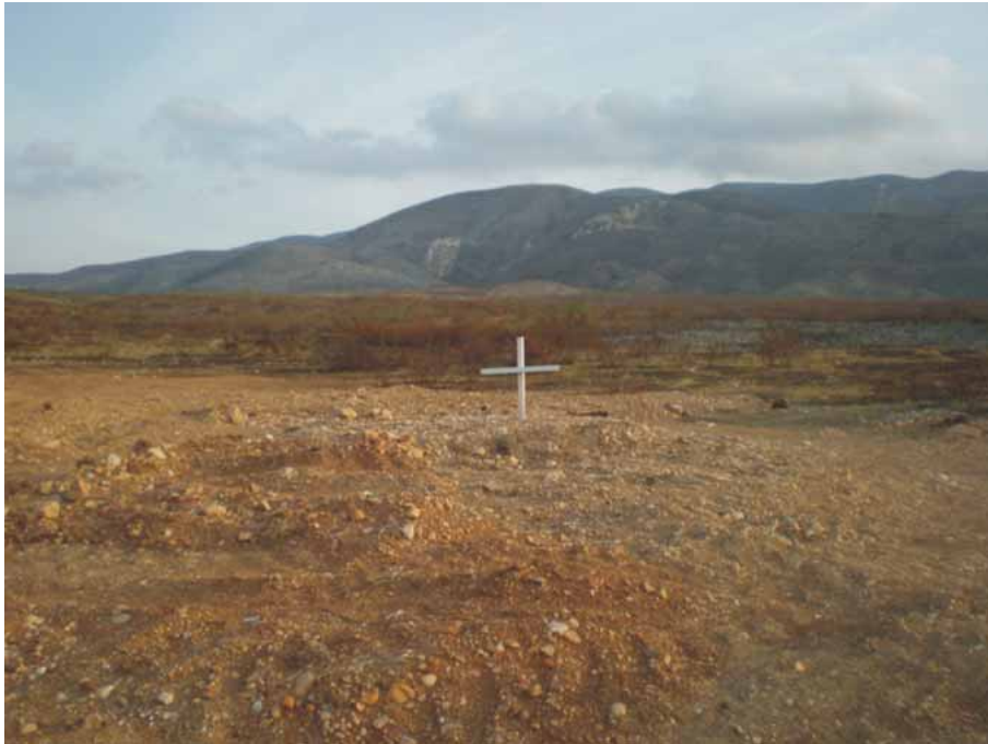
The remains of many victims were collected in trucks and disposed in hurriedly dug pits in Port-au-Prince and its environs.

It is important to note that even up to a month after the earthquake, it was not unusual to see dead bodies dumped along the roadside and in waste disposal piles. Some of these were collected and sent to mass burial sites, where they were buried in smaller pits. The situation concerning the disposal of victims is now more or less under control, although the same cannot be said about the bodies that were buried in mass graves.