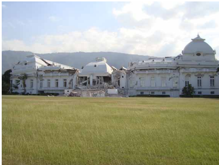
The presidential palace in Port-au-Prince was extensively damaged by the earthquake and will need to be demolished.

The initial response and, to some degree, the ongoing response to the disaster have been impacted by the trauma faced by the occupants of these “lifeline” buildings. Yet, reasonably designed and reinforced structures would have withstood a 7.0 magnitude earthquake, so the question needs to be asked of why these critical buildings did not. There are two main reasons for this.