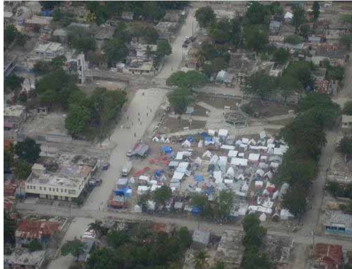
Hundreds of improvised camps that were set up across Port-au-Prince in the days following the earthquake.

As a consequence, camps were established on closed streets, a children’s park, a football ground, a square outside the presidential palace, the ground below the Prime Minister’s house, outside the airport, near the MINUSTAH camp, near foreign embassies, as well as in hundreds of other locations. Along the road from Port-au-Prince to Leogane, the most sought after camp location is at the median of the road.