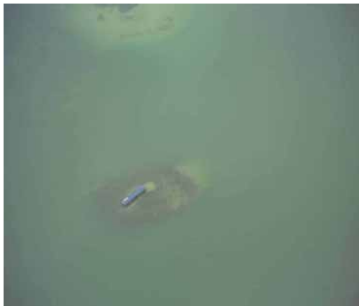
After the earthquake, a number of containers in the main port were washed out to sea, causing some concern for potential contamination.

into the sea. Fortunately, there is no indication so far that these containers contained any chemical or harmful substances.