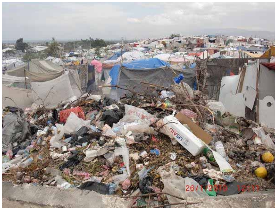
The lack of solid waste management in IDP camps creates many health risks for residents.

In addition to human waste, camps also produce the solid waste that can be expected from any human settlement. There is currently no designated area, collection system or disposal arrangement for solid waste management in the camps. Whenever proper camps are set up, these issues will need to be given due consideration as well.