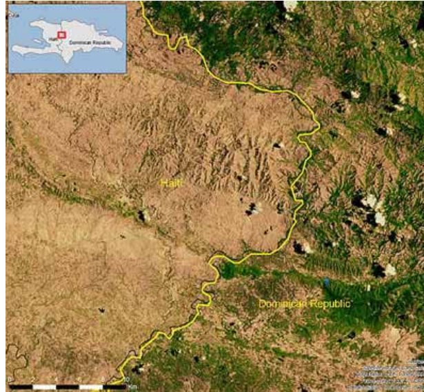
Severe deforestation in Haiti is clearly contrasted with the forest cover across the border in the Dominican Republic.

soil erosion. Haiti's very sustainability had been significantly eroded by resource degradation, including severe deforestation. Environmental governance in the country was also facing severe constraints due to a lack of comprehensive legislation, institutional capacity and the wider economic reality of the country, which had relegated environmental management far down on the list of governmental priorities.