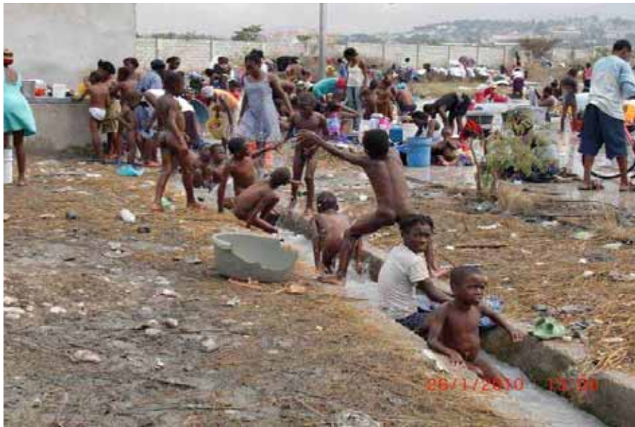
In the absence of adequate sanitation facilities in the camps, children bathe wherever they can find water.