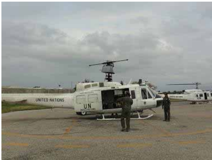
The UNEP team flew over earthquake-impacted parts of the country, surveying possible damage to land masses, ports and the coastline.

In order to give targeted assistance to agencies undertaking recovery and reconstruction operations, and to provide environmental inputs to the various UN and other planning processes, field visits are necessary. However, in the short period of time available between the event and when key decisions are taken, it is not always possible to conduct extensive site visits to all areas; nor is it always feasible to have a multidisciplinary team move around the country due to logistical difficulties.