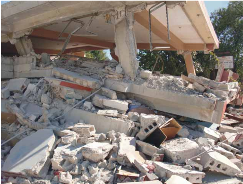
Concrete hollow bricks were often incorrectly used as load-carrying building material, and collapsed easily during the earthquake

Concrete is such a popular building material in Haiti that it is used in all new construction work – for walls, roofing, floors, compound walls and columns. A number of key advantages help to explain why it is preferred over wood: