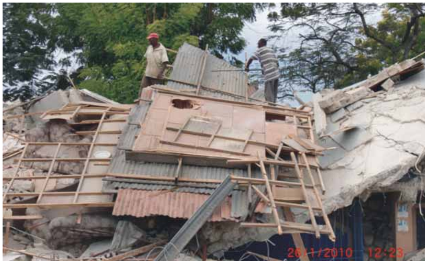
Disaster debris often contains a lot more than just brick and wood.

In fairness hollow bricks, in addition to being easy to make and work with, have a number of advantages. In areas subject to heavy wind and rainfall, they provide stability, and in the past international donor agencies have promoted hollow brick construction as part of disaster risk reduction and community resilience projects in countries with similar vulnerabilities to Haiti. In places where the use of clay for brick-making has caused environmental damage – including threatening food security when paddy fields are used for extracting clay, for example – governments have promoted hollow bricks as environmentally desirable alternatives. Furthermore, building with hollow bricks requires far less cement (for bonding), no mortar and often no paint (both additional costs when conventional bricks are used), making them an unavoidable low-cost alternative and a standard element of construction in the developing world.