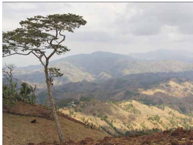
Extensive deforestation and erosion greatly exacerbated physical vulnerability to the January 12 earthquake.

As a result, Haiti suffered significantly more than its neighbour the Dominican Republic during the frequent cyclones and tropical storms that hit the Island of Hispaniola, and in the rainy seasons. A cursory look at a “Google Earth” image of the island shows a clear contrast between the eastern and western parts. The eastern two thirds appear green (covered in forests and vegetation), while the western third appears almost completely brown (heavily deforested). Flying over the island, the contrast is even more striking. Not only are there more trees in the eastern part, but one can also see a better network of roads and transport infrastructure. In addition, no siltation from rivers – which makes the sea appear brown at the estuary – is visible.