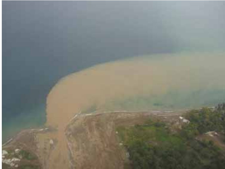
The upcoming rainy season is likely to increase sediment flows into the sea, potentially impacting mangrove forests, coral formations and fisheries.

In addition, there will be a significant increase in sediment flows into the sea on both sides, leading initially to discoloration that will impact the natural beauty of the sea, and thereby likely impact on tourism. This excessive sedimentation will impact the mangrove forests in Petit Guave, the coral formations along both sides, and may also impact fisheries, at least in the shallow zone.