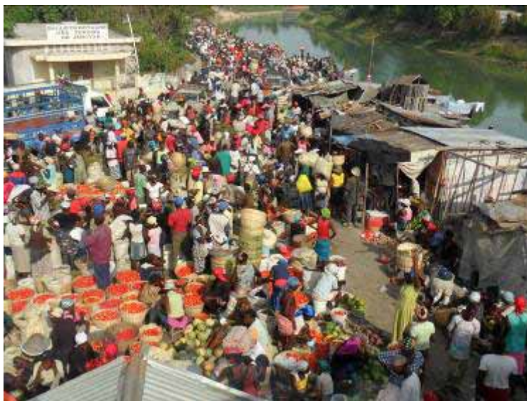
An informal economy quickly reestablished itself in earthquake affected communities, aided by livelihood initiatives promoted by the international community.

While all of the ideas above are good and fit well within the overall humanitarian assistance framework in Port-au-Prince, they may be jeopardizing the longer term plans of decongestion. Indeed, people often react to incentives in unanticipated ways. If land ownership, social services, guaranteed employment and higher wages are provided in Port-au-Prince, individuals in the regions, even those who have not been impacted by the earthquake, will most likely travel directly to the city and set up a tent. Consequently, it is quite conceivable that there will be more people in Port-au-Prince when the reconstruction is over than when it began.