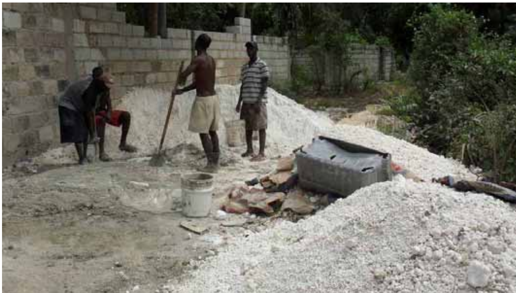
The use of existing approaches to making concrete will rebuild the same vulnerabilities into future construction.

One of the most alarming trends observed in post-earthquake Haiti was that in the absence of a clear understanding of the role played by inadequate design and improper use of building materials, the same building materials are being used to execute repairs and to construct new buildings. This was noted even in the most impacted areas, where the man-made nature of the destruction is by now self-evident. It is imperative that these patterns be reversed to ensure that the vulnerabilities that led to tragic loss of life and destruction are not perpetuated.