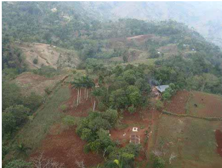
Significant soil erosion caused by deforestation reduces the ability of top soil to support vegetation.

With current knowledge about the chemistry and geology of the rocks and climatic factors, the following situation can be predicted with some certainty.