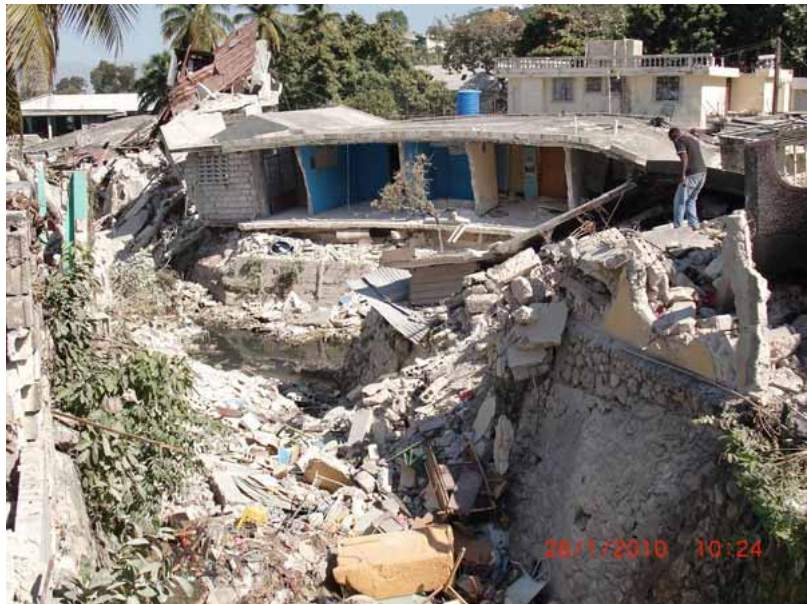
The collapse of municipal waste management services in the immediate aftermath of the earthquake led to the accumulation of everyday waste alongside disaster debris.

Once homeowners and communities will have collected all the material that is safely recoverable, the problem of managing the millions of tons of disaster debris will remain. The ongoing management plan that was initiated by the US Army and funded by USAID is based largely on the collection of concrete in demolition debris and its removal to pre-designated areas where it can be safely disposed of, including in coastal areas.