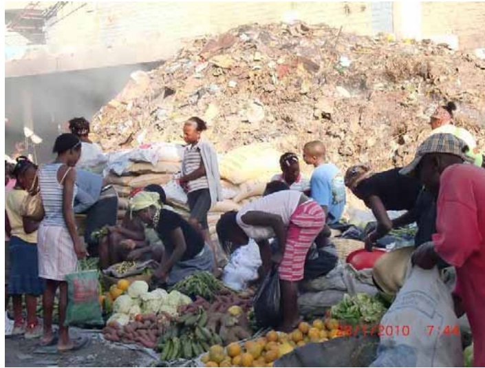
Vendors set up stalls all over Port-au-Prince, often within range of large uncollected waste piles.