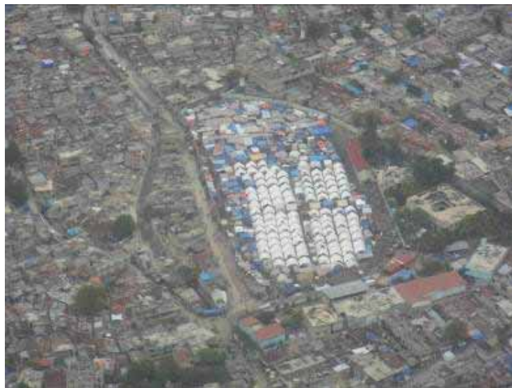
A densely populated IDP camp situated in the middle of Port-au-Prince. Although half a million people left the capital in the days following the earthquake, food distribution figures are increasing rather than shrinking.

It was also evident that in spite of the decisions taken in Port-au-Prince, there was hardly any UN or NGO presence in Gonaives to support those who had relocated there. While the Government had started a programme to register the displaced, it appeared as though the international relief apparatus still had no idea where people actually were.