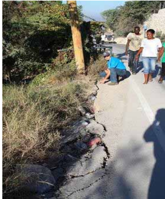
A UNEP expert inspects road damage in the days following the earthquake.

In 2009, working with the Government of Haiti, the William J. Clinton Foundation, the Earth Institute at Columbia University and various agencies of the United Nations, the UN Environment Programme (UNEP) formulated a comprehensive country-wide strategy known as the Haiti Regeneration Initiative (HRI), aimed at reducing poverty and disaster vulnerability in Haiti through the restoration of ecosystems and livelihoods based on sustainable natural resource management.