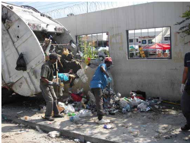
Municipal waste services have resumed across Port-au-Prince, although coverage is still limited.

Municipal solid waste management in Haiti is similar to that of many developing countries, and is characterized by a culture of low wastage and high recycling, coupled with limited institutional management of the facilities for the disposal of those materials that cannot be reused or recycled.