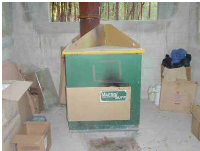
A number of hospital waste incinerators remained functional following the earthquake, aiding in medical waste management.

The mystery of the missing healthcare waste was partly solved when investigations were initiated to ascertain where the hospitals were disposing of their medical wastes. It came as a great relief when it was established that a number of these hospitals had incinerators which had remained functional throughout.