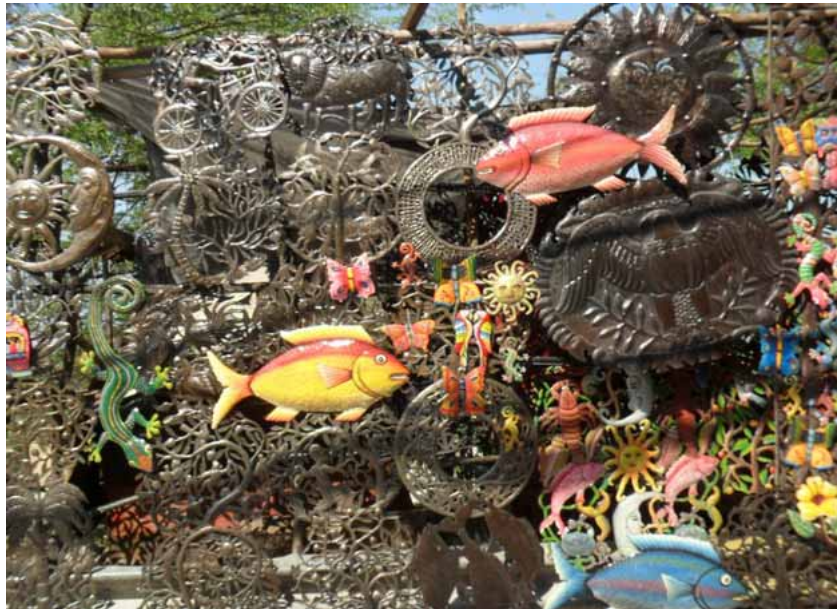
Rebuilding Haiti will require far more than brick and wood – it will require a substantial effort to bring back the country's environmental sustainability